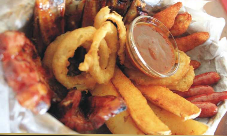
Rugby Basket for 2