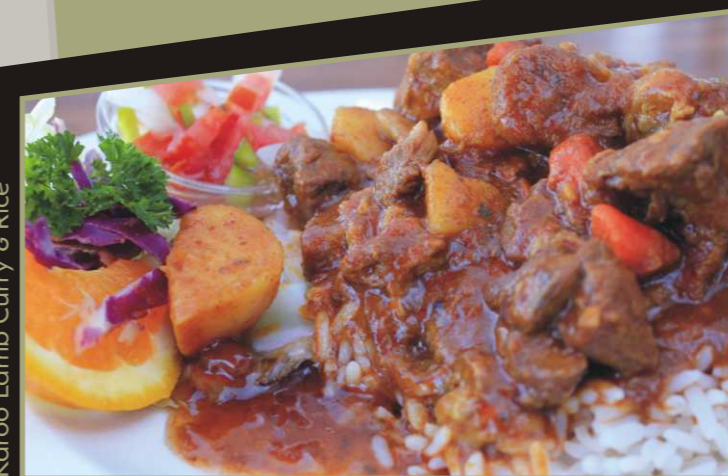
Karoo Lamb Curry & Rice