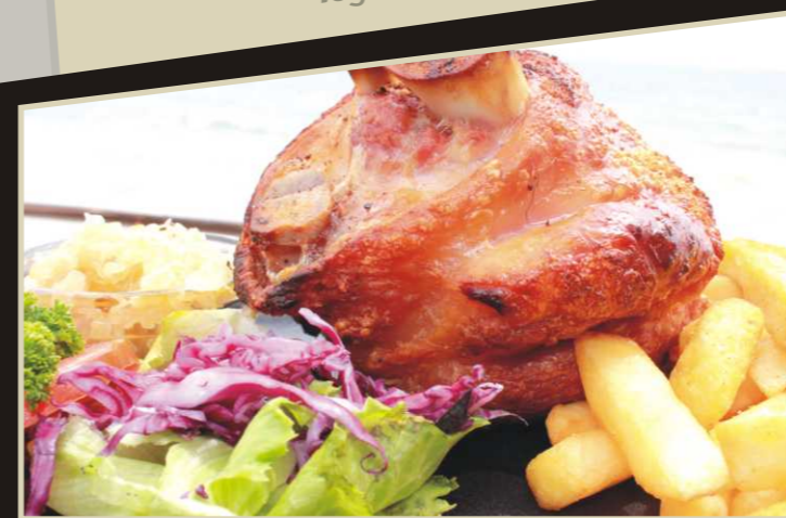
Eisbein "The King of Crisp"

All steaks served with onion rings. Try one of our legendary sauces.