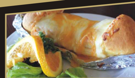
Giant cheesy garlic roll

Fresh Saldanha mussels simmered in a creamy garlic sauce served with dunking bread.