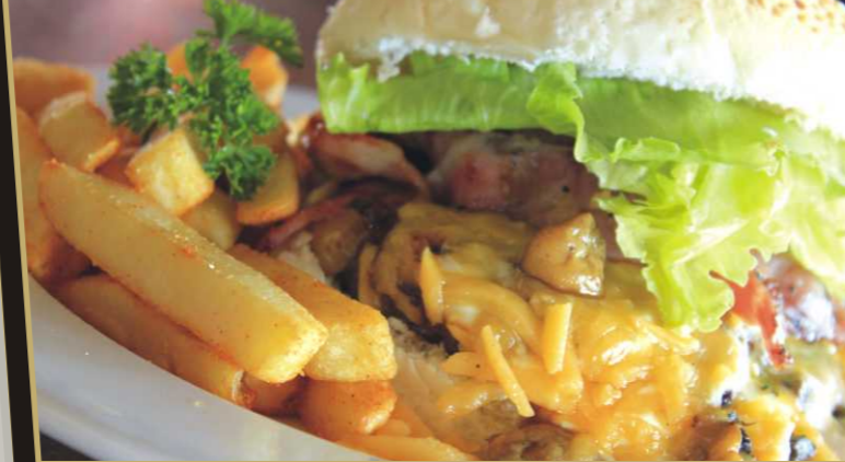
Barney's "Build a Burger"