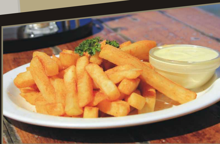
Plate of Chips & Sauce of Your Choice

A selection of great wines to accompany any meal... or to be enjoyed on its own.