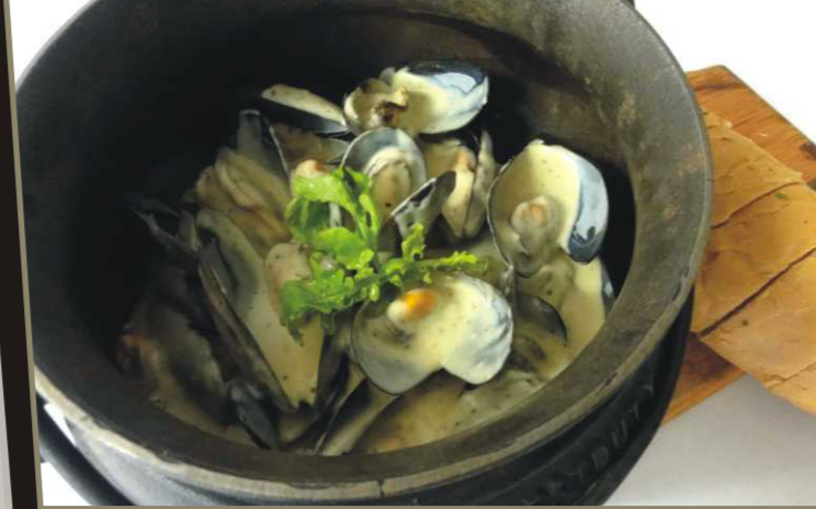
Creamy garlic mussels