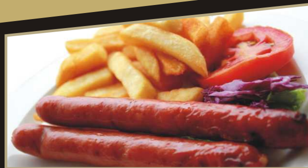
Cheese grillers & Chips