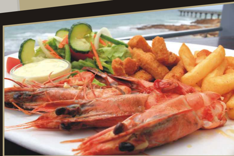
Prawns & Calamari Combo

Lightly flavoured and fried till golden brown. Your choice of steak strips or rings. Served with chips or rice and a salad.